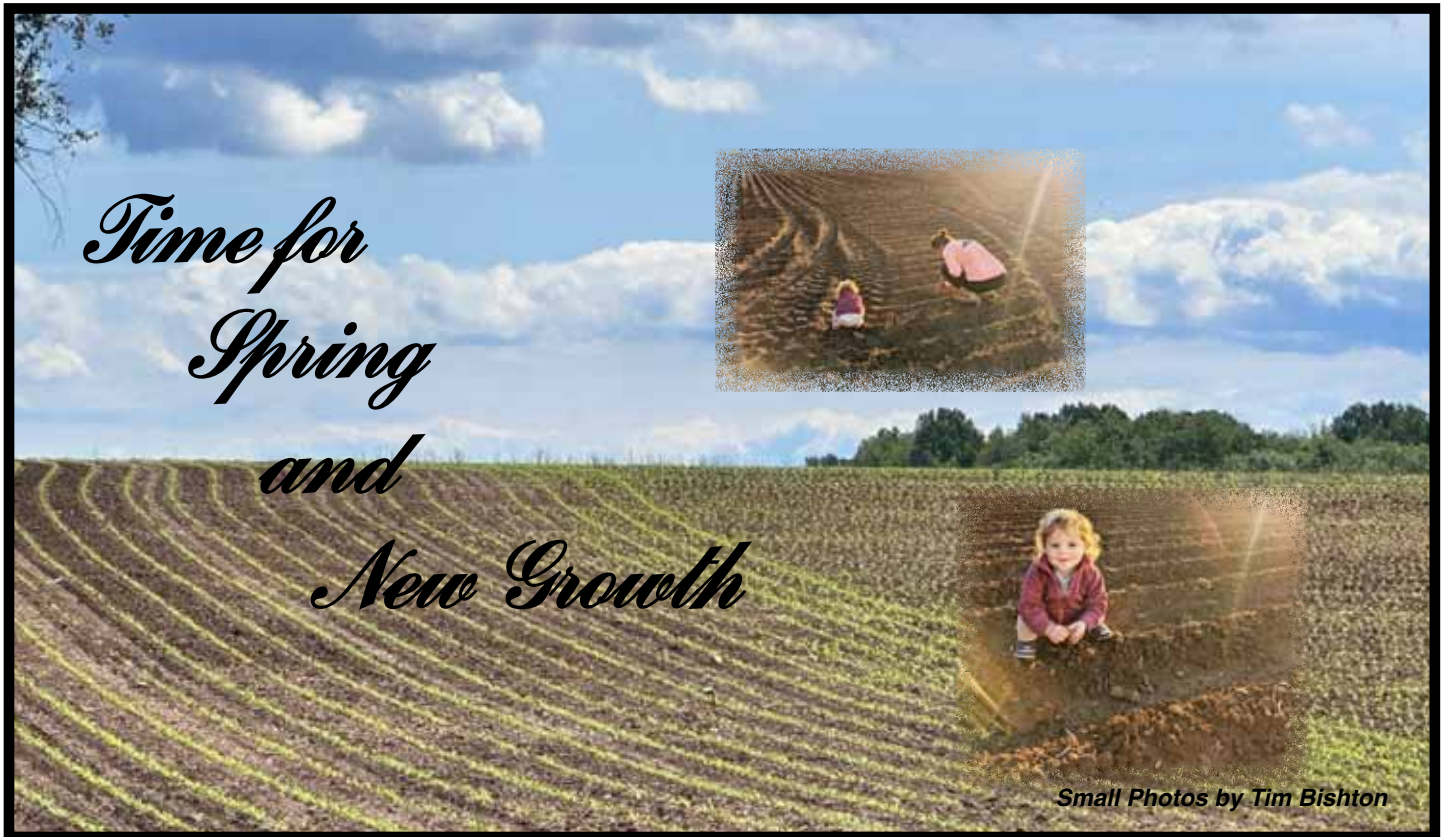
Small Photos by Tim Bishton